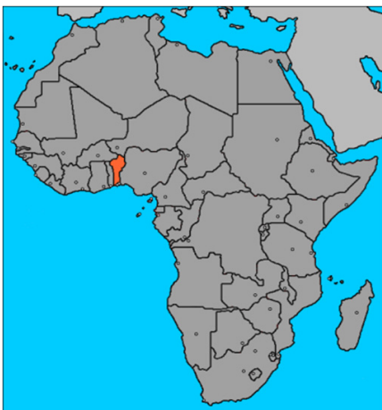
Figure 1. The Position of Benin on a Map of Africa