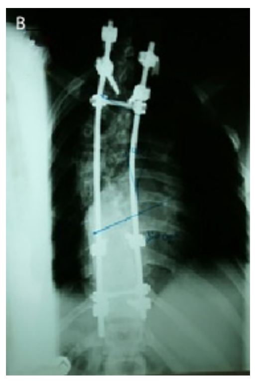
Figure 2. Plain Radiographs Anteroposterior View: (A) Preoperative Plain Showing 65 Degrees Scoliosis, (B) 12 Months Postoperative Plain Showing the Correct Alignment of the Spine