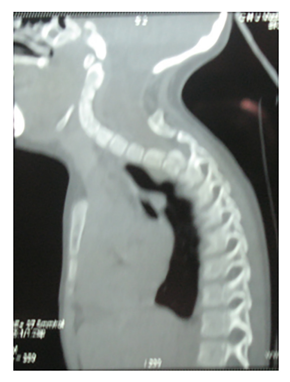
Figure 2. 2D CT Scan Reconstruction Showing Enlargement of Foramen Magnum and Absence of Posterior Arches of C1 and C2