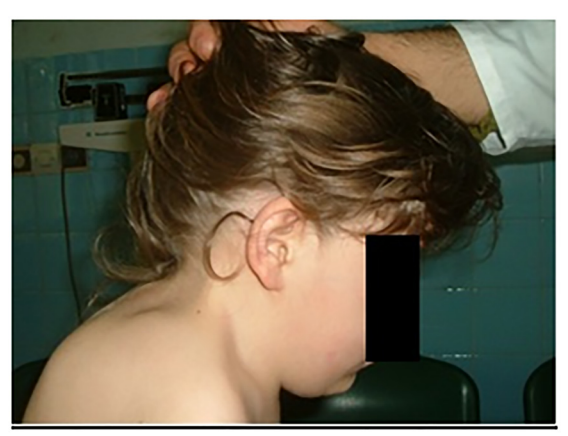
Figure 1. Short Neck in Patient under Study