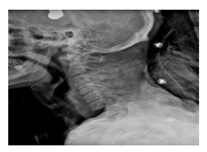
Figure 2. A lateral X-ray of the cervical spine C6-C7 was not defined

Data on severe spondylolisthesis or traumatic cervical spondyloptosis without a neurological deficit are scarce [7, 10-12]. The first case of cervical posttraumatic spondyloptosis without neurological impairment was an 8-year-old girl, who was reported in 1992 by Shekha and associates. She was treated by posterior fusion alone [13]. Few cases of C6-C7 spondyloptosis were reported since 1992, dominant management in all of them was Anterior Corpectomy and Fusion (ACF) and Posterior Fu-