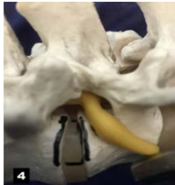
Figure 4. Schematic photograph showing extended extraforaminal opening. L4 root is retracted cranially.

A & B: Showing removal of the blade via extended extraforaminal corridor. L4 root located is cranial to the surgical entry (Black arrows).