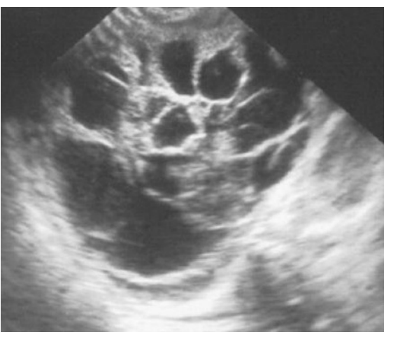
Figure 3. Ultra sound grey scale images of liver mesenchymal hamartomas