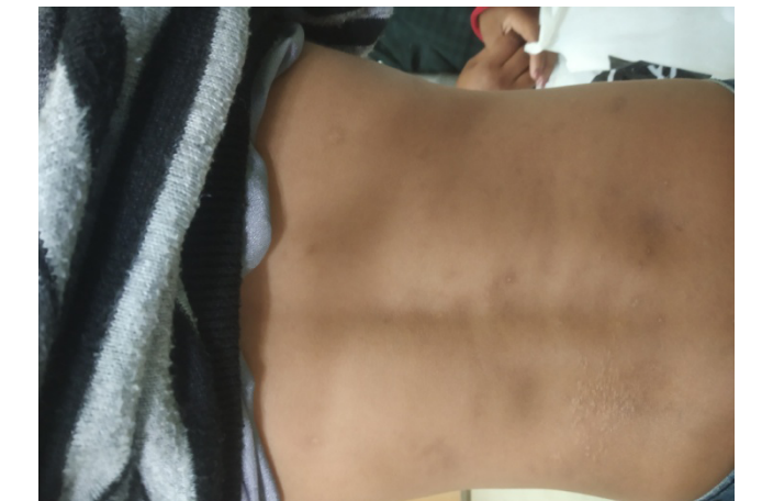
Figure 5. Orange peel appearance hyper pigmented lesion on the back of trunk