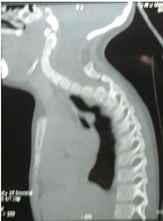
Figure 2. 2D CT Scan Reconstruction Showing Enlargement of Foramen Magnum and Absence of Posterior Arches of C1 and C2