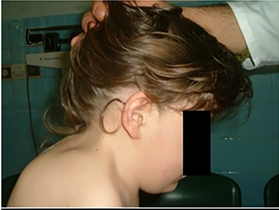
Figure 1. Short Neck in Patient under Study